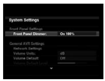
Figure\ 37-Systems\ Settings\ Screen

The AVR 760/AVR 660 offers system settings for ease of use. These settings may be accessed from the System Settings menu, which is selected by pressing the AVR Settings Button and navigating to the System line. Press the OK Button to display the System Settings menu. See Figure 37.